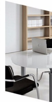
Studio / Office